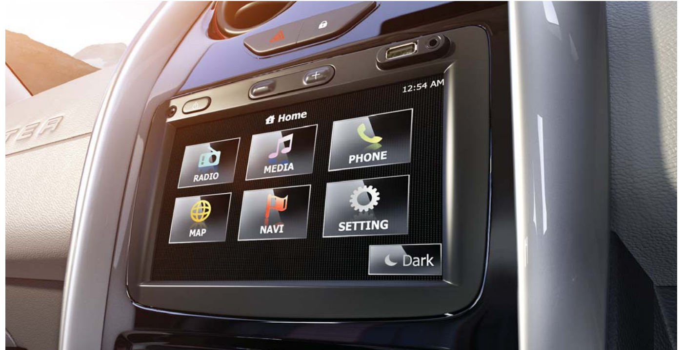
Touchscreen infotainment system

The first-in-class MediaNAV ensures an entertaining and relaxed drive. The touchscreen infotainment display features radio, USB and Aux-in connectivity and GPS navigation as well. The MediaNAV also eases your driving experience by enabling hands-free calling. Now wherever you go, stay connected.