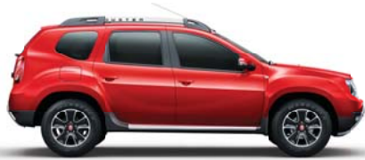
New Fiery Red