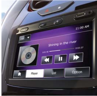
Dynamic multimedia player