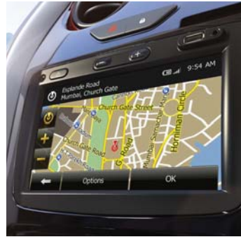
GPS satellite navigation