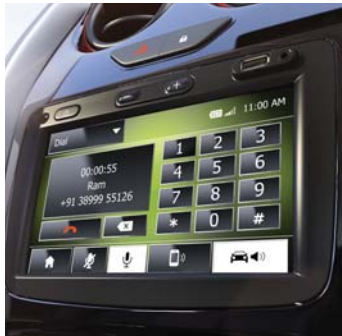
Phone control via Bluetooth®