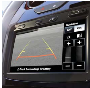
Reverse parking camera with guidelines